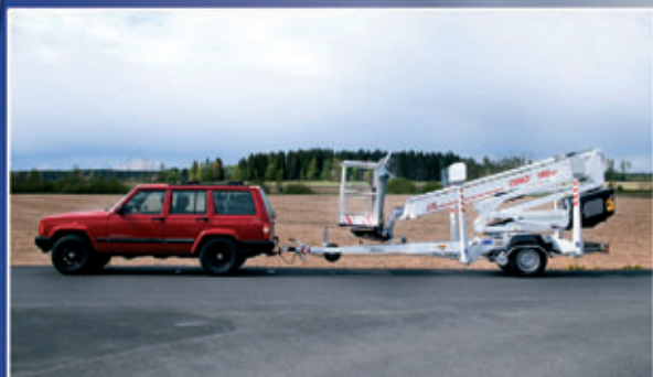
Compact and agile – easy to tow and move on site.