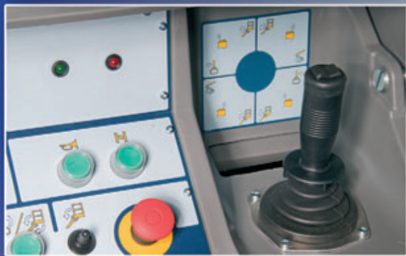
Proportional steering with one joystick – enables exact positioning of the platform.