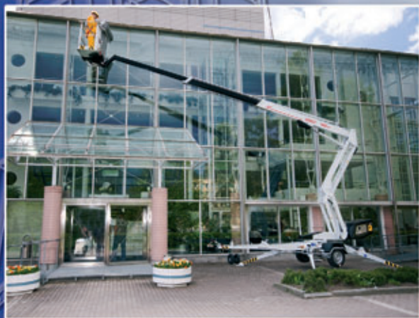
Long horizontal outreach with full load – ensures safe access to work positions.